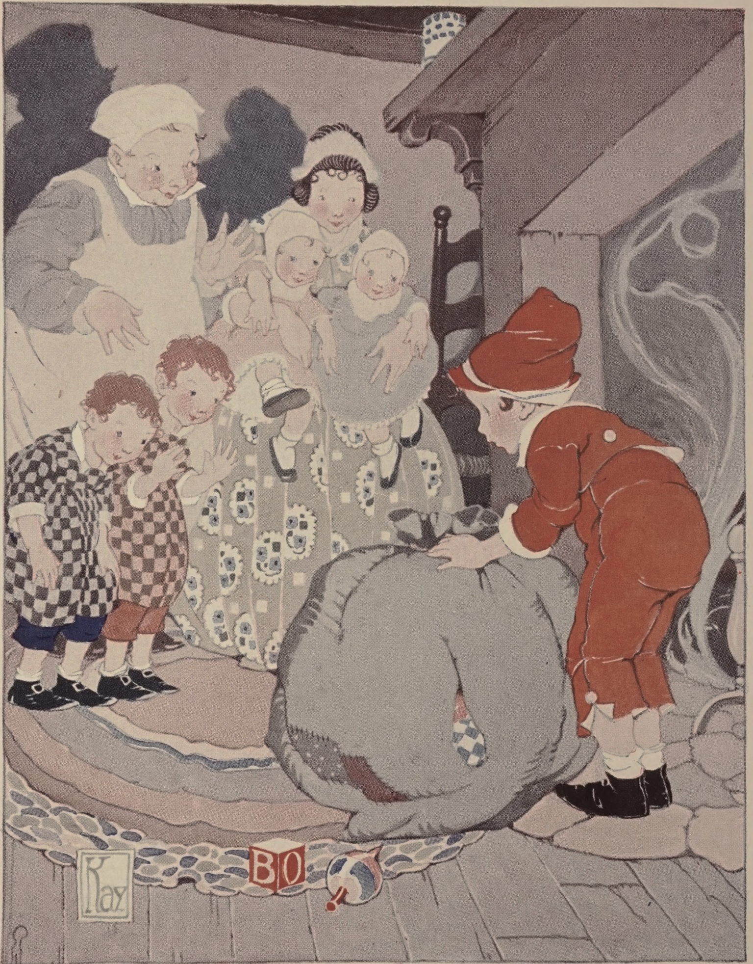
'I have toys for my little brothers,' cried Santa